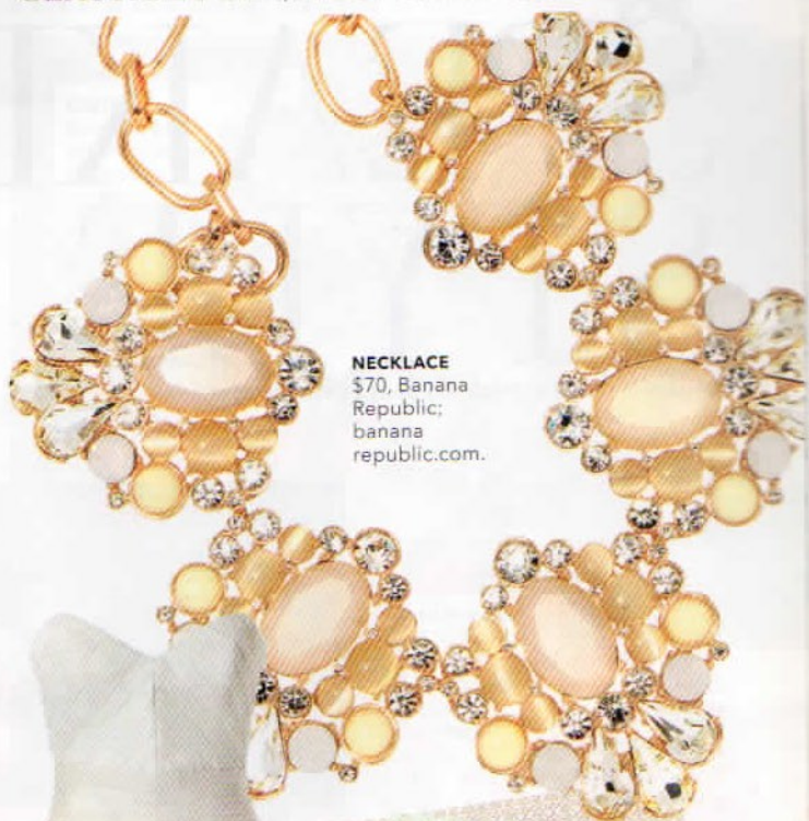
NECKLACE $70, Banana Republic; banana-republic.com.