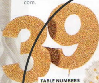
TABLE NUMBERS $7 each, Wendy Addison; bhldn.com.